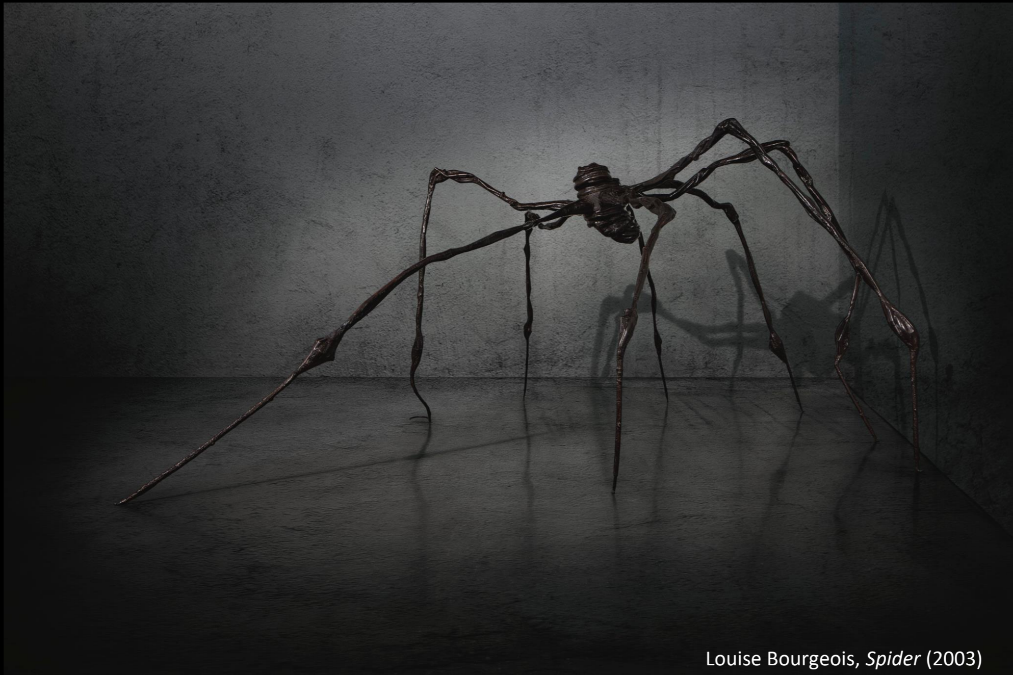
Louise Bourgeois, Spider (2003)