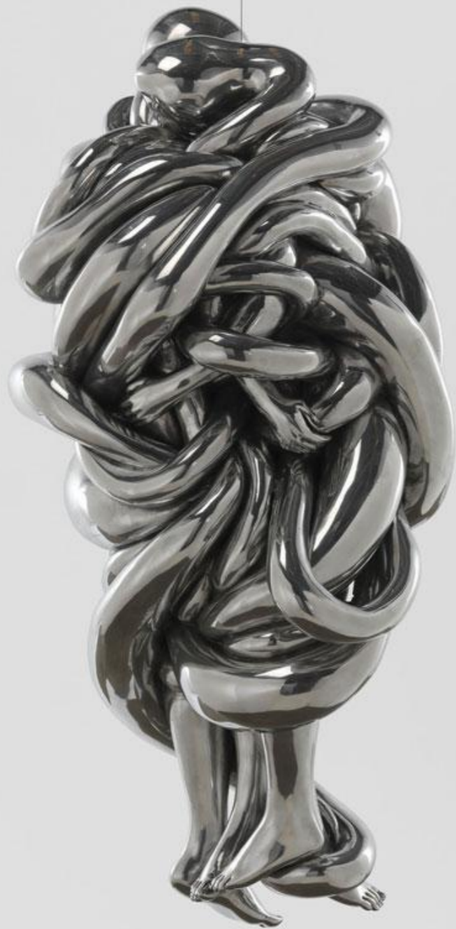
The Couple (2007-2009) Cast & polished aluminum 61 x 30 x 26" (154.9 x 76.2 x 66 cm)