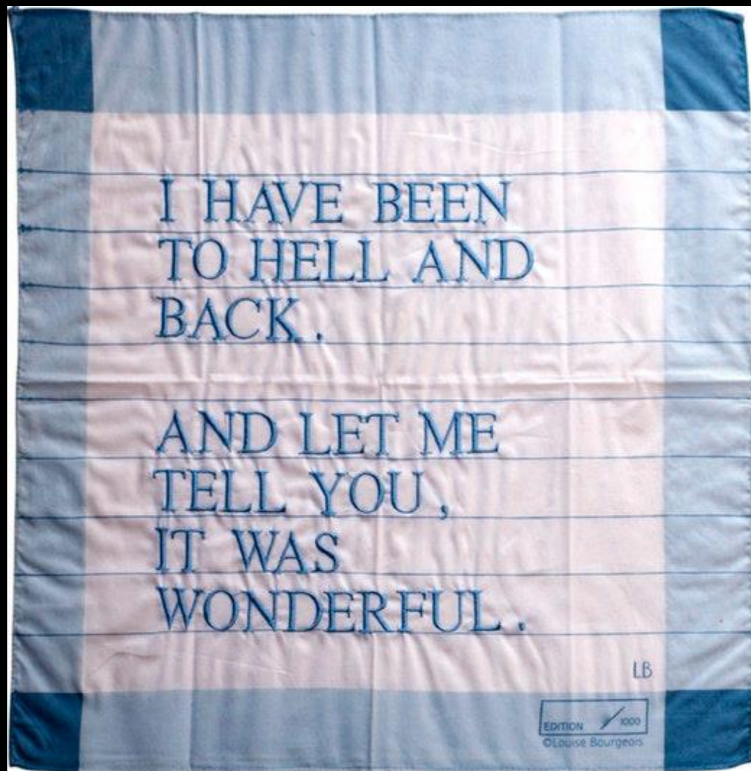
I Have Been to Hell and Back, And Let Me Tell You It was Wonderful (Blue), 1996

https://www.youtube.com/ watch?v=qy7xJhImnLw