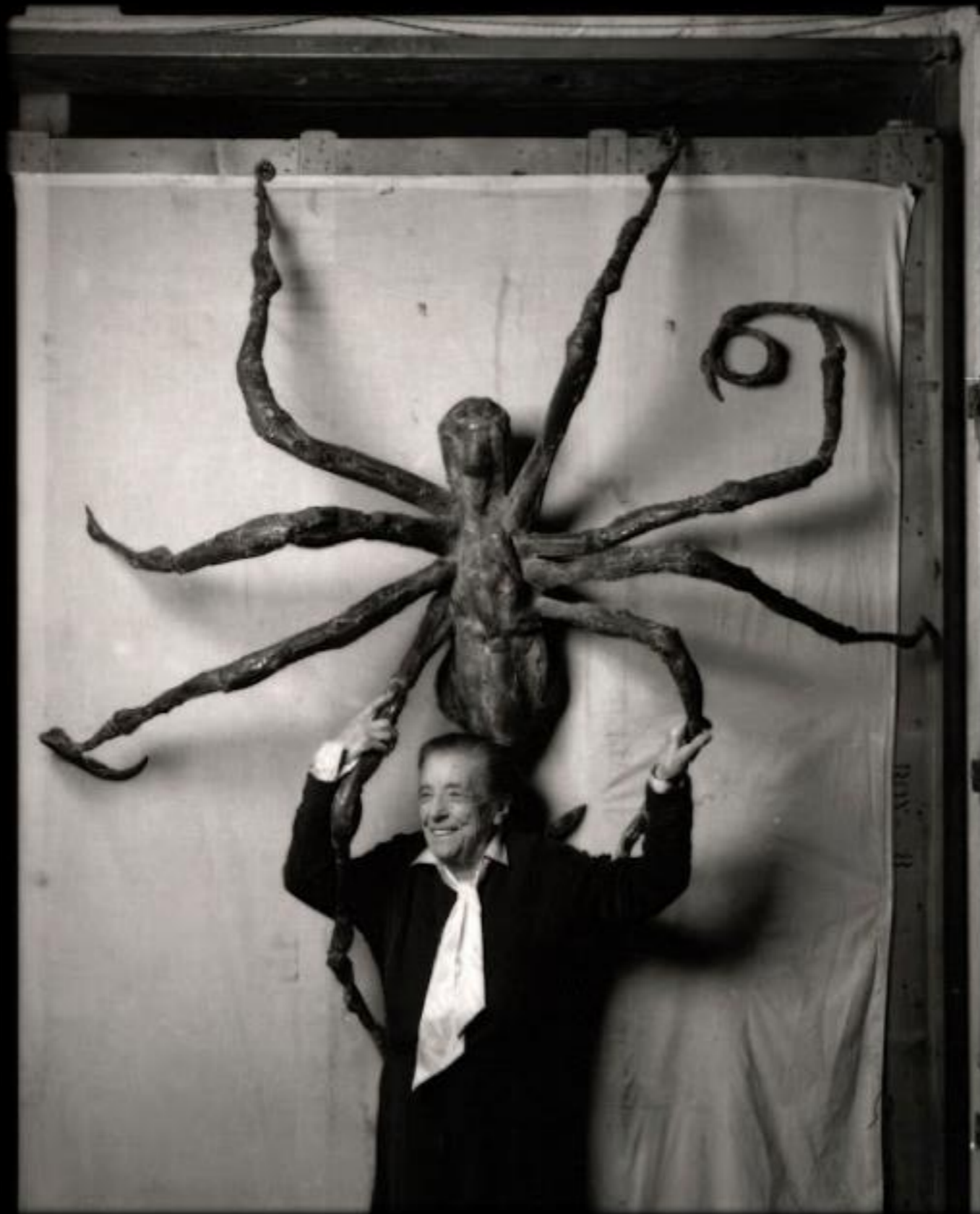
Louise Bourgeois in her Brooklyn studio in 1996 with her sculpture, SPIDER IV.