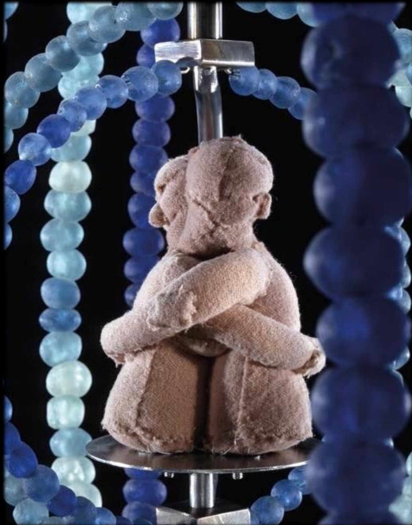
The Couple (2002) Glass, beads, fabric and steel