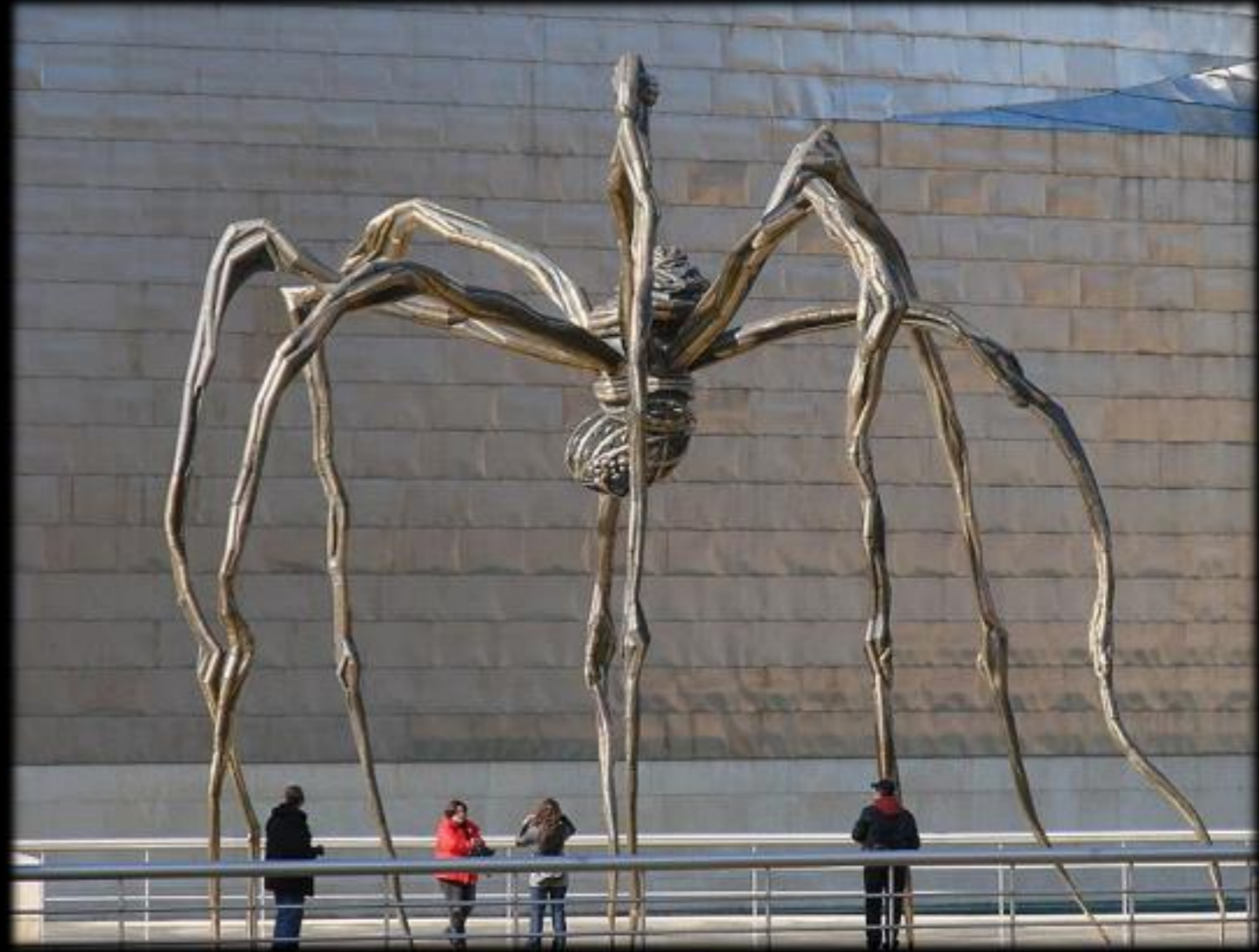
Maman (1999) Bronze, stainless steel, marble

*Please note—if these links do not work, I can email them to you. Reach out & let me know.*