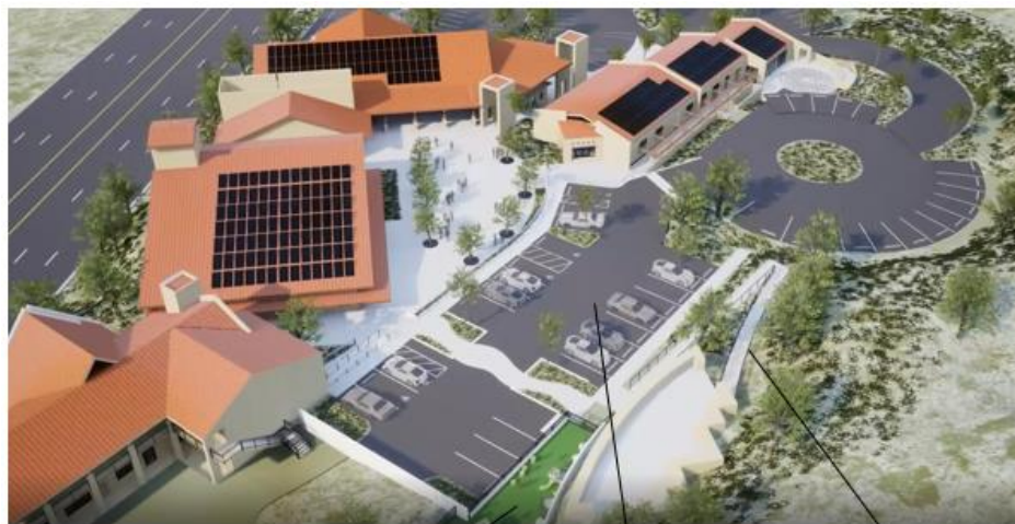
New playground New parking Lot New Columbarium walkway

Phase 2 will be completed during summer 2020 and includes demo of the existing Parish Hall to allow construction of the expanded upper parking area, providing 50 parking spaces and safer drop off for Preschool children and folks with disabilities. We will also remove the existing steep ramp up to the Columbarium to create space for a new playground for younger children where that steep ramp used to be, and a new low-slope walkway will be constructed up to the Columbarium. And we will also complete a walkway from the lower parking lot to the upper-level Chapel patio. All the many ministries, meetings and community groups that currently meet in the Parish Hall will be relocated to alternate meeting sites during Phase 2 and Phase 3 construction.