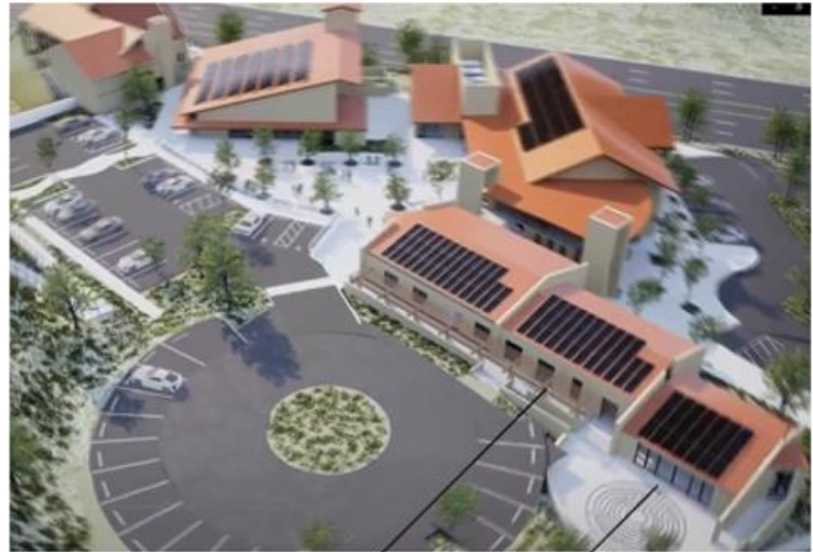
Youth/MPR Room Chapel--Patio

Phase 1 was completed in summer 2019 renovated Administration Building space to create a Chapel, Youth/Multi-Purpose Room with adjacent kitchenette, and ADA updated bathrooms. Worship services, Youth Group, Deacon Bill's Bible Study Class, SamMul Korean Presbyterian Church, parish meetings and many additional user groups are already using these new spaces.